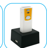
*MOQ only* Charging cradle*

*Contact Unitech Europe for more minimal order quantities (MOQ) details.