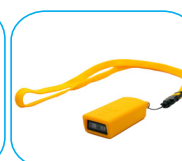
3210-900019G Protective Case (anti-microbial)