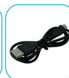
1550-900104G Micro USB to USB cable